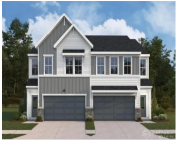
WILDER - 102 MEADOWLARK LANE, BROOKVILLE, OH 45309