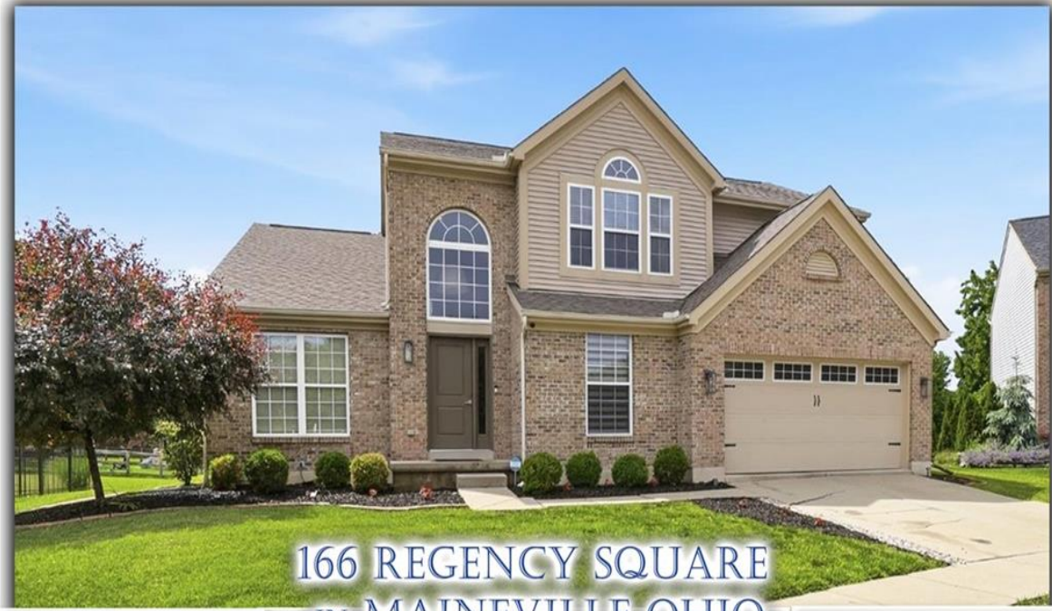
166 REGENCY SQUARE IN MAINEVILLE OHIO

166, Regency, Square, Maineville, OH, 45039