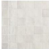
Shower Wall Tile