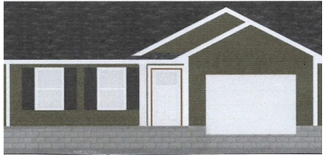
202 Green Street