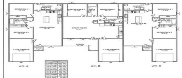
204 Green Street 202 Green Street 200 Green Street