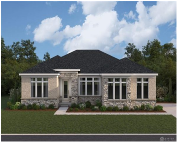
WINSLOW - 2439 BENT GRASS DR BEAVERCREEK, OH 45431 Exterior Selections