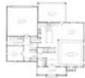
FIRST FLOOR 2ND FLOOR MASTER CONCEPT SKETCH II