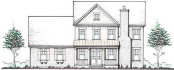
FRONT ELEVATION 2ND FLOOR MASTER CONCEPT SKETCH II