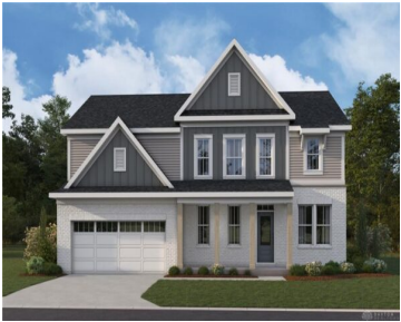
WYATT - DEERPATH CIRCLE, BELLBROOK, OH 45305 Exterior Selections