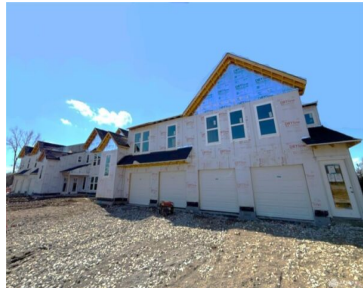
HAYWARD - 420 PILOT POINT, VANDALIA, OH 45377