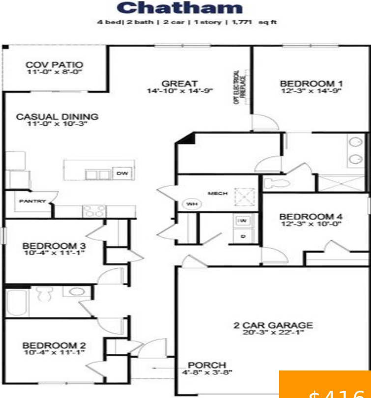
*Homeplan layout reflecting elevation A

461, Hollywood, Boulevard, Xenia, OH, 45385