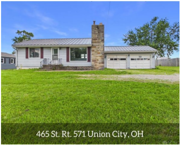
465 St. Rt. 571 Union City, OH