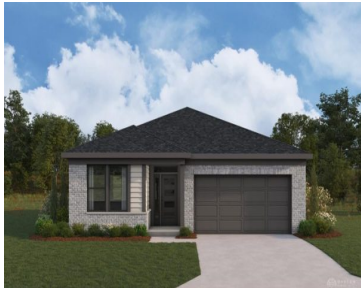
AMELIA - 5220 LONG MEADOW DRIVE FRANKLIN, OH 45005