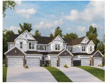
SAYBROOK - 5353 AUGUSTA DRIVE LEBANON, OH 45036