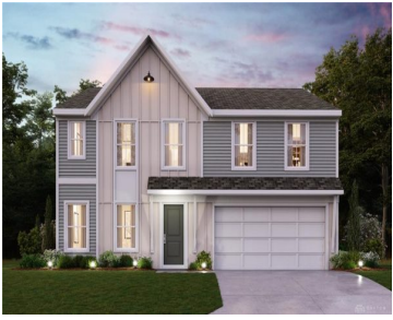
JENSEN - 662 TULIP COURT YELLOW SPRINGS, OH 45387 Interior Selections