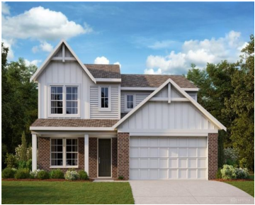
FAIRFAX - 6429 RIVER BIRCH STREET TIPP CITY, OH 45371 Exterior Selections