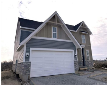
AVERY - 6513 RIVER BIRCH STREET, TIPP CITY, OH 45371