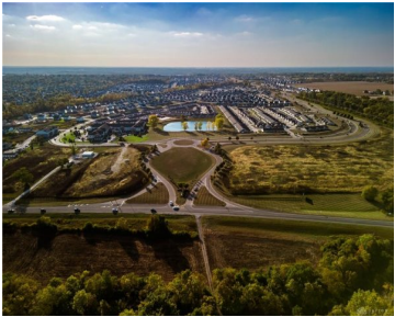
GRANDIN - 6519 RIVER BIRCH STREET, TIPP CITY, OH 45371