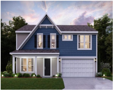
JENSEN - 690 DEERHURST DRIVE VANDALIA, OH 45377